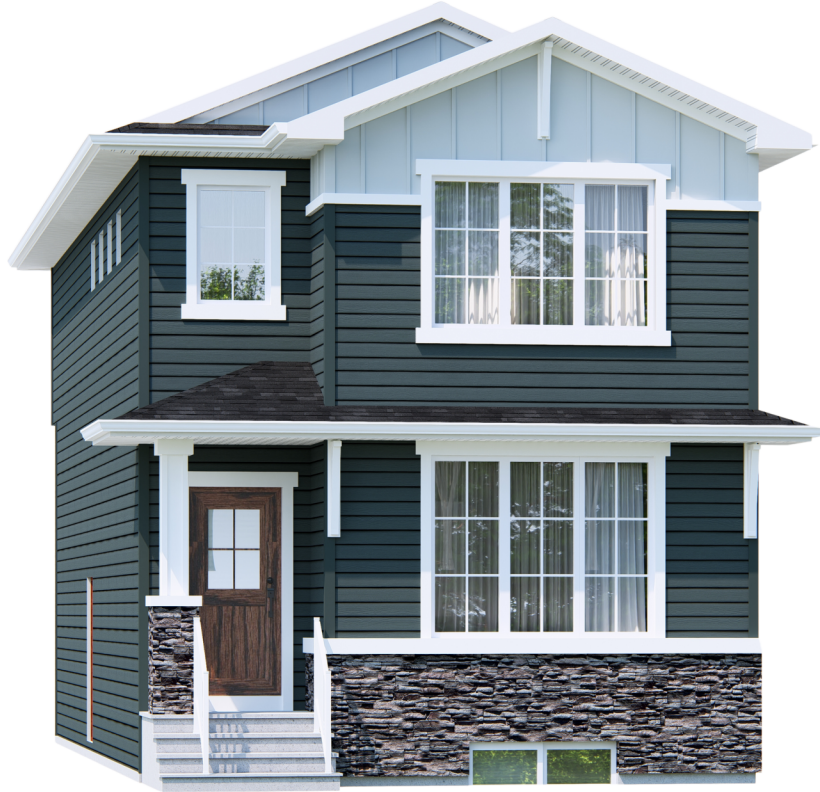
CONCORD II - CRAFTSMAN