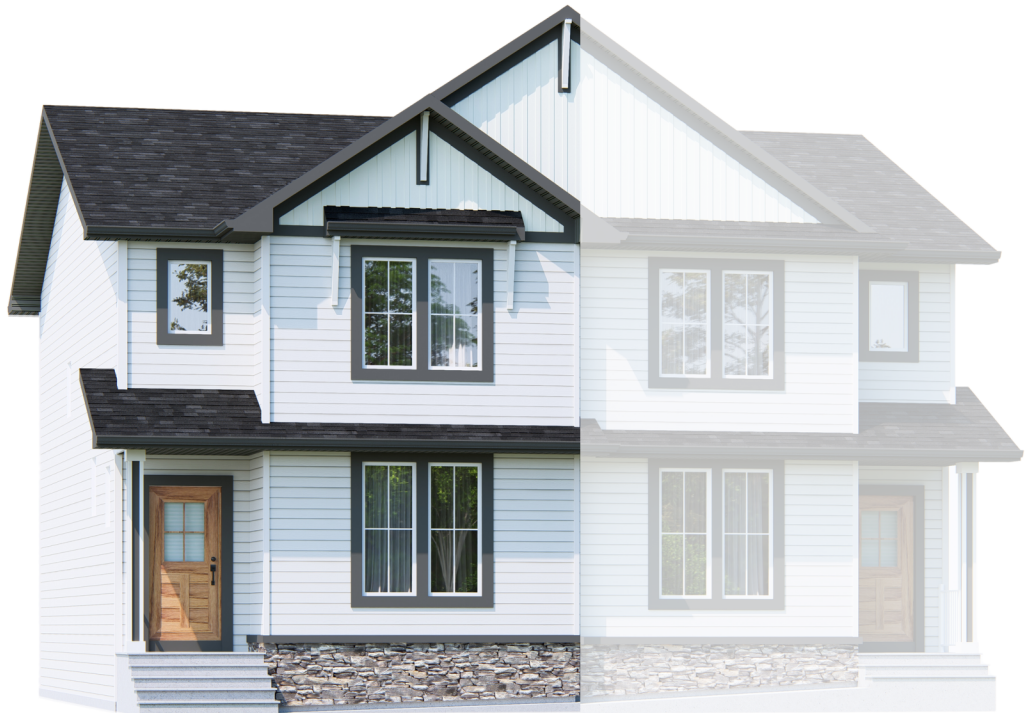
NEWPORT II - FARMHOUSE