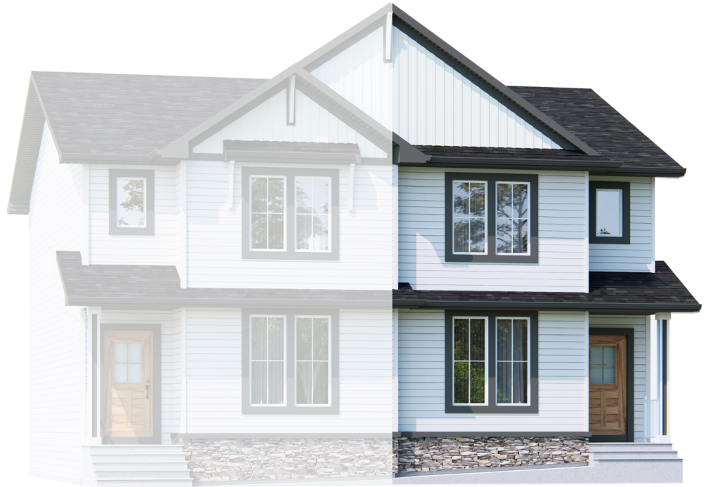
NEWPORT II - FARMHOUSE